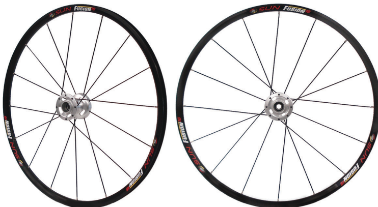
Fusion 16 wheel - silver hub

Available in 24" (540mm) 25" (559mm) 26" (590mm)